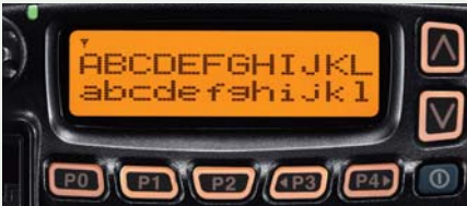
Two line setting display example.

With a high contrast dot matrix display, upper and lower case characters can be easily distinguished. You can change the display setting to show one line and 12 characters, or two lines and 24 characters via programming. LCD backlighting is useful for night time operation.