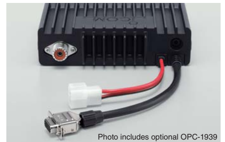
Photo includes optional OPC-1939

With the optional OPC-1939 D-SUB 15-pin ACC cable, the IC-F5022 series can be programmed to control an operating channel from an external device (up to 16 preprogrammed channels). The ACC connector also provides an ignition sensing function, external PTT, PC command, horn honk, audio output and modulated signal input depending on programming.